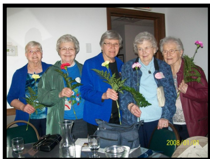
Some of our 60 plus year HCE members.