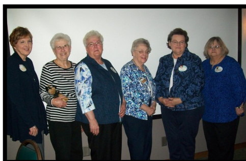
Many of the Bizi-Belles Club members were celebrating their 40 year in HCE!!