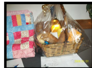
Silent Auction Items!