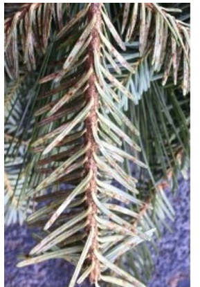
The brown spots visible here on the underside of the needles of an infested tree are the "scale" covering immature insects.

Elongate hemlock scale is a native to Asia and has been introduced to Michigan and other eastern states.