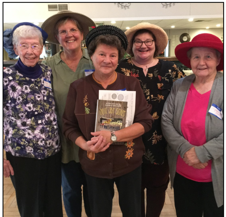
Some of the Shawano County HCE (Landstad Ladies) members who attended the Learn-In.

Lunch was a yummy meal of Caesar salad, lasagna, garlic bread, and apple dessert. The cooks at Main Event created a delicious meal that set the tone for together time to relax, chat, laugh, and process the new information we had learned during the morning sessions.