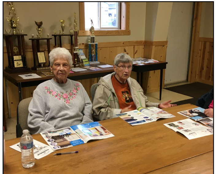
Navarino Merri Maids members at their Stanley & Watkins November fundraiser.