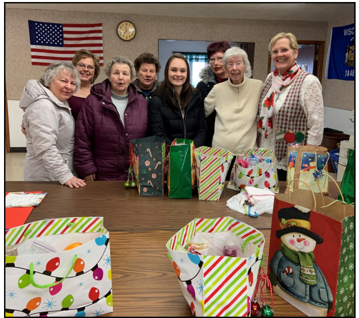
Landstad Ladies with holidays bags: December 2019