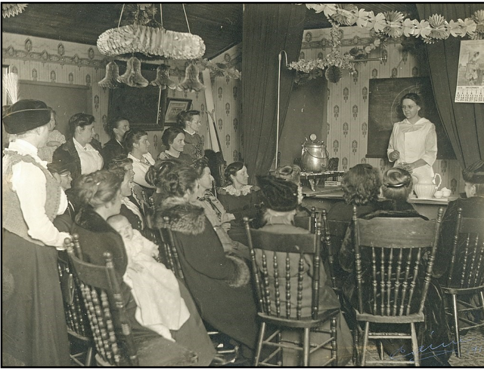
Meat canning demonstration at meeting of Akron Home Economics Club on December 19, 1916.