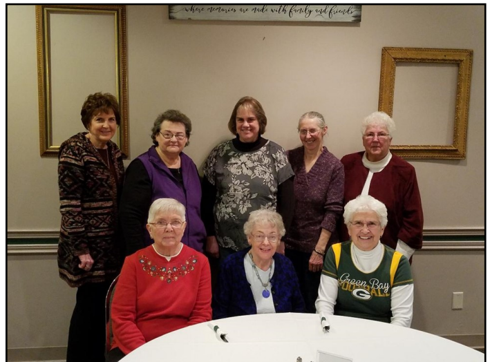
Bizi-Belles HCE Club enjoyed their Christmas party At The Gathering on January 12, 2020